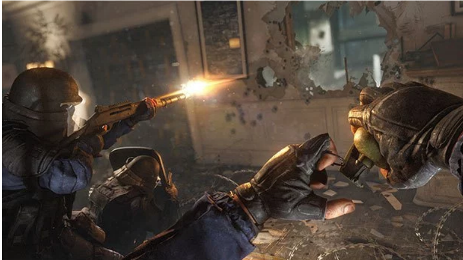
Rainbow Six Siege.

"When you sit down and use the tools all day, it really changes their perspective completely," he says. "Making it simple is hard."